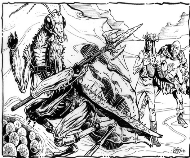
Race 7: Thri-Kreen